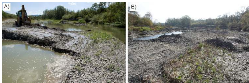
Fig. 4. Gravel mining on the Ondava River near the Breznica village (A) and channel destruction by mechanisms (B).