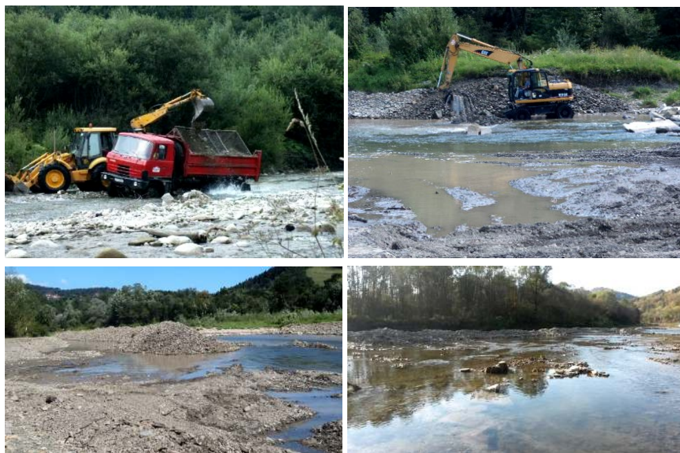
Fig. 1. Illegal gravel mining in Polish Carpathians: excavators and lorries in work and river gravel bed degradation after illegal gravel activity

From the author's calculations, it appears that the transport of bed load in Czatożanka and Jałowiecki streams region was about 14 000 tonnes after the year 1950. This means that from the channels of the discussed streams, much more gravel was removed than reached the Małe Widły region. What does this mean for the stream channel? As mentioned above, streams tend to reach some kind of equilibrium and such an equilibrium is generated after the bed load is taken out of the stream (Fig. 1). When a stream doesn't receive enough bed load from Babia Góra, it starts to erode its own bed and banks. Next, it starts to cut into the bed deeper and deeper, often through gravel formations and rock stratum. This means that the stream is deprived of its protective cover – the previously mentioned armouring – it is like a skinned living organism. The consequence of such a condition is the Jałowiecki and Czatożanka streams cutting into their beds to a depth of approximately 80 cm in some places, even over 1 m over the period of the last 50 years (on the basis of the author's estimated calculations, observations and field interviews).