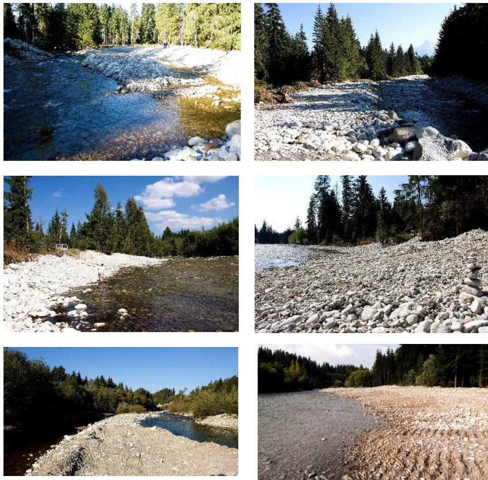
Fig. 2. River gravel bed degradation after illegal gravel activity on Slovakiens rivers.

flow channel and isolated floodplain from the active channels due to 2 m high new artificial banks. This type of river regulation including gravel extraction and gravel replacement were also occurred on the river reaches where the residential area is missing and there was no threat to property rights and lives.