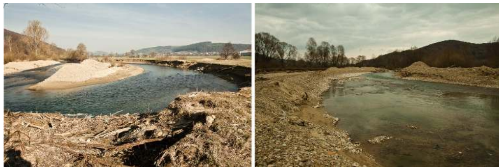
Fig. 3. River gravel bed degradation after illegal gravel activity on Slovakiens rivers.

We could conclude that gravel mining has significant influence on morphological processes during last study period (after 1987) when the formation of sinuous single-thread river pattern was registered. We can identify a several evolution phases for both rivers. The first one is channel degradation as a reaction of the climatic changes on the end of the Little Ice Age. The second one is riparian forest development (stabilization phase) between 1981 and 1987 supported by low flood activity. Extreme flood events after 2002as well as gravel mining led to intensive erosion processes (1,9 m bedrock incision on the Ondava River) and new floodplain vertical benches creation. This vertical differentiation on the Topľa River is not so significant. Rinaldi et al. [2] conclude that braided rivers with higher sediment supply are more sensitive to gravel mining than sinuous and meandering river with lower sediment supply.