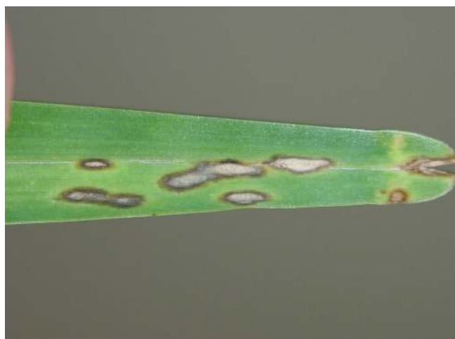
Figure 1. Leaf spot symptoms of gray leaf spot are shown on a St. Augustinegrass leaf blade. The gray coloration in the center of the lesions is a flush of spores produced after incubation at 100% relative humidity for 24 hr. Rapidly expanding lesions will sometimes have an olive green water-soaked border.

persist, leaf spots can expand to blight above-ground plant tissue.