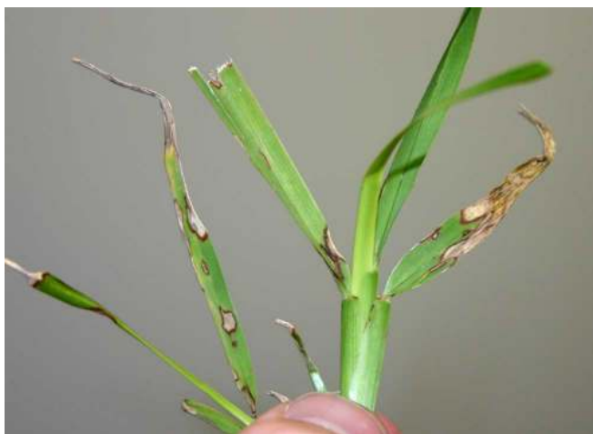
Figure 2. Gray leaf spot caused by Pyricularia grisea on a shoot of St. Augustinegrass. Lesion centers are straw-colored and surrounded by a dark necrotic border. Lesions may appear on the leaf blades, leaf sheaths, and stolons.