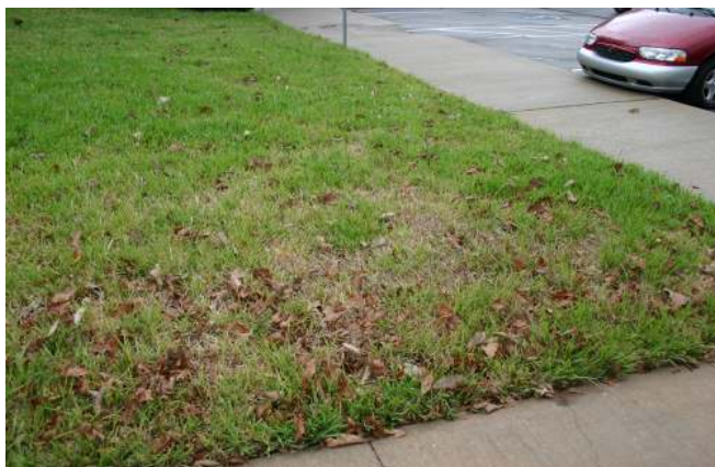
Figure 3. Established stands of St. Augustinegrass that are stressed may turn chlorotic, thin, and take on a generally unthrifty appearance when affected by gray leaf spot. Closer inspection will reveal many leaf spots on individual shoots.

The most diagnostic disease symptom is an oblong leaf spot, the center of which may have a gray felt-like growth of sporulation after extended periods of warm moist conditions (Figure 1). A leaf spot may appear olive green to brown with a dark brown border when sporulation is not present (Figure 2). When the disease is severe, stands may appear thin and generally unthrifty (Figure 3). Closer inspection will reveal several leaf spots, many of which may have coalesced to turn entire blades or shoots brown. The disease generally reduces vigor of the turf and can slow grow-in of sprigged areas and the recovery of damaged St. Augustinegrass (Figure 4).