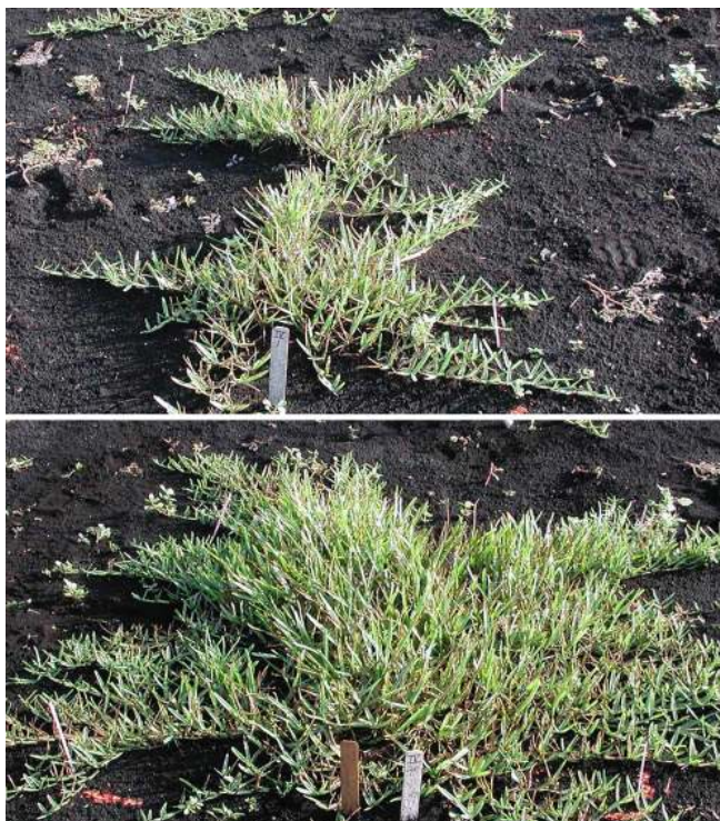
Figure 4. Gray leaf spot can substantially reduce vigor and can prolong the grow-in phase of St. Augustinegrass sprigged for sod production. Both sprigs in the figure were planted at the same time, but only the plot on the bottom was treated with a QoI fungicide product to prevent gray leaf spot.

The most diagnostic disease symptom is an oblong leaf spot, the center of which may have a gray felt-like growth of sporulation after extended periods of warm moist conditions (Figure 1). A leaf spot may appear olive green to brown with a dark brown border when sporulation is not present (Figure 2). When the disease is severe, stands may appear thin and generally unthrifty (Figure 3). Closer inspection will reveal several leaf spots, many of which may have coalesced to turn entire blades or shoots brown. The disease generally reduces vigor of the turf and can slow grow-in of sprigged areas and the recovery of damaged St. Augustinegrass (Figure 4).