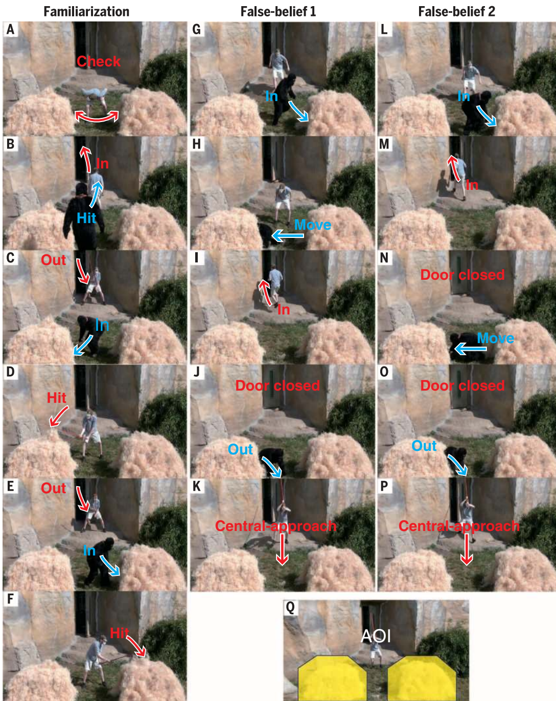
Fig. 1. Events shown in experiment one. (A to F) Familiarization. (G to J) Belief induction for the FB1 (false belief one) condition. (K) Central approach for FB1. (L to O) Belief induction for FB2. (P) Central approach for FB2. (Q) Areas of interest (AOIs) defined for the target and distractor haystacks. See movie S1.

individuals' tendency to look to a location in anticipation of an impending event and thus can measure a participant's predictions about what an agent is about to do, even when that agent holds a false belief about the situation. Only two studies have used spontaneous-gaze false-belief tasks with nonhuman primates. Both failed to replicate with monkeys the results with infants, despite monkeys' success in true-belief conditions (11, 12).