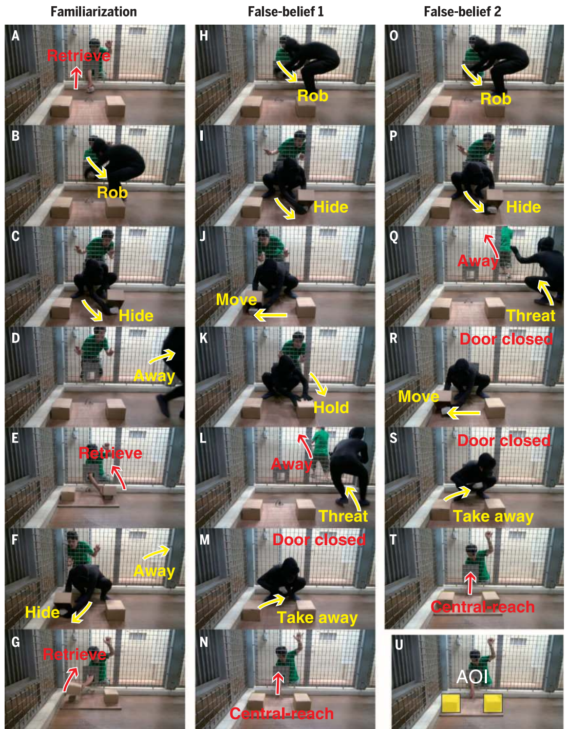
Fig. 2. Events shown in experiment two. (A to G) Familiarization. (H to M) Belief induction for the FB1 condition. (N to S) Belief induction for FB2. (T) Central reach for FB2. (U) AOIs defined for the target and distractor boxes. Following the infant study (10), we included an additional action in FB1 [KK touched the distractor box (K)] to control for subjects looking to the last place that the actor attended. See movie S2.

(FB1) or absent (FB2). In both conditions, the object was then completely removed before the agent returned to search for it. The actions presented during the induction phase controlled for several low-level cues—namely, that participants could not solve the task by simply expecting the agent to search in the first or last location where the object was hidden or the last location where the agent attended (10). Whether the object was hidden first in the left or right location during familiarization trials and whether the target of the agent's false belief was the left or right lo-