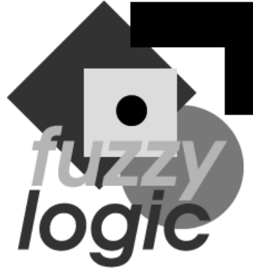
Figure 1: Original 256 \times 256 grey-scale image.

In this section we present some experiments showing the differences between basic morphological operators using different conjunctions. We compare the outcomes of the operators based on fuzzy logic with the corresponding flat operators using a crisp structuring element. Our input image is depicted in Fig. 1. The structuring function G used for the ‘fuzzy’ operators