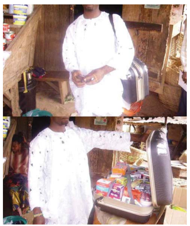
Figure. Itinerant medicine vendor in Oja-tuntun marketplace, Ile-Ife, Nigeria.

pilot programs have been hampered by drug supply issues, particularly the difficulty in removing cheaper, resistancecompromised drugs, which are all the poor can afford, from the market (35). As long as demand for antimicrobial drugs exceeds their supply, uncontrolled and inadequate regimens will be the norm. To combat resistance in poor countries, antimicrobial agents will have to be made more available. For best results, when improved supply increases selective pressure, drug misuse and resistant-strain dissemination must decline. Thus, antimicrobial drugs need to be made available along with the infrastructure to monitor their utility and improve selection. Special considerations are needed to encourage patients to procure and consume a complete regimen and to ensure antimicrobial drug quality as close to the point of care as possible. These are formidable challenges because antimicrobial agents are available from unsanctioned, as well as sanctioned, providers and the former may have little or no training and unorthodox means of drug distribution.