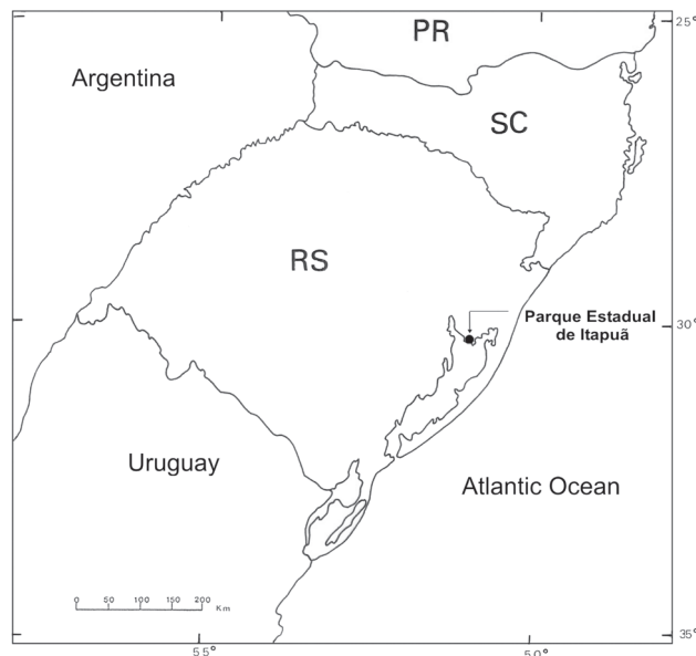
Figure 1. Map of Rio Grande do Sul, showing Parque Estadual de Itapuã, the site of sampling.

This study was carried out in the Parque Estadual de Itapuã (PEI) (30°22'S 51°02'W), located in the city of Viamão, Rio Grande do Sul, Brazil (Fig. 1). PEI is a remnant of the natural landscape of this region, and is destined for conservational