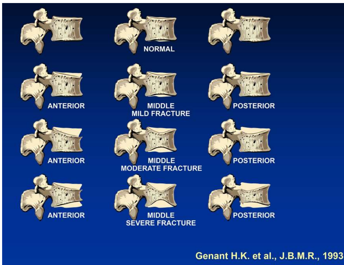
Fig. 1 Evaluation of spinal deformities based on Genant criteria

that makes it possible, using radiation doses (50 \mu Sv, about 1/100 lower compared to conventional radiography) to capture the entire dorsal and lumbar spine in a single image while providing contextual measurements of vertebral body height limited to the T4–L4 area. The vertebral morphometry technique is applied to images to assess the severity of vertebral fractures previously diagnosed by means of SQ,