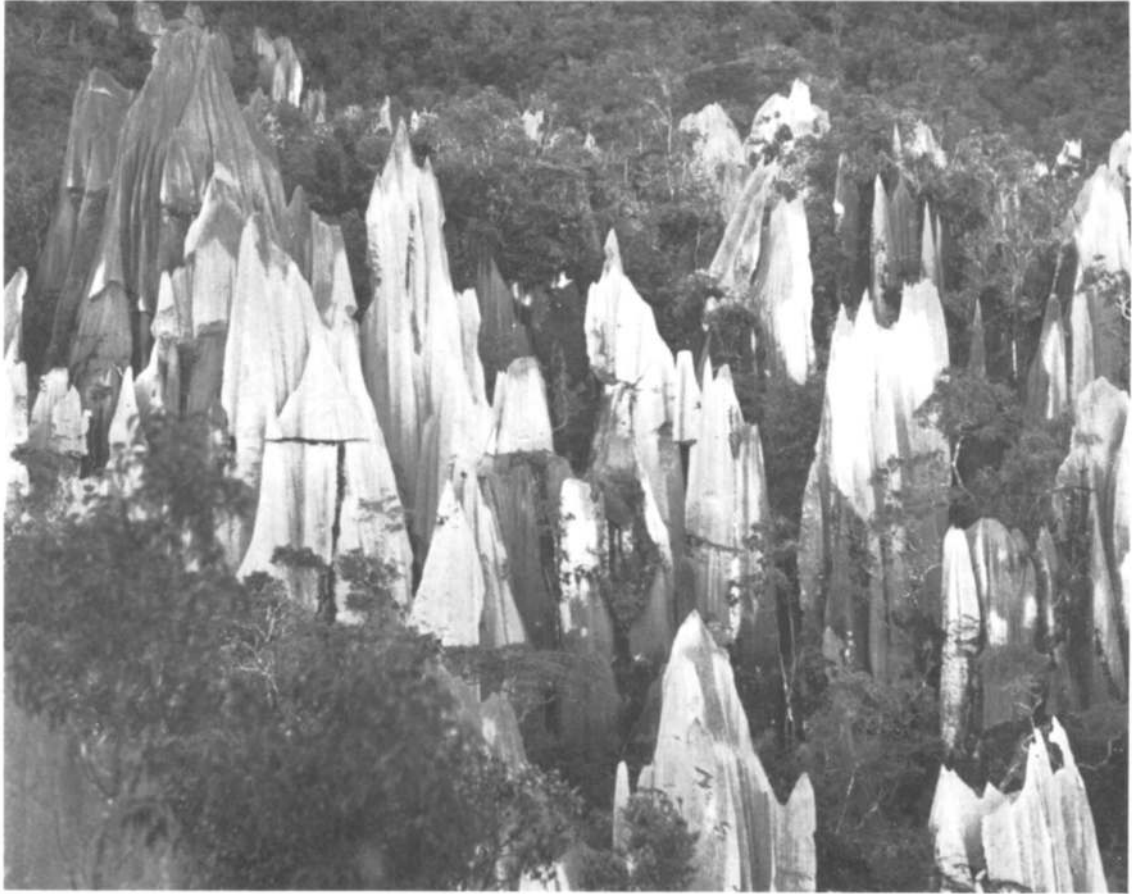
Limestone pinnacles tower 30 m above the forest canopy on Gunung Api, Gunung Mulu N.P. (Clive Jermy).

or less broad transitional zone to lower montane forest and nowhere on the mountain are boundaries well demarcated. The slopes lead up to spurs which bear dense root-matted, reddish-brown, raw humus and a flora which is structurally between mixed dipterocarp forest and kerangas . At 1200 m upper montane forest appears on Mulu (see Table). Here there is a preponderance of the oak family (where Lithocarpus hatuSIMAE is common) and the conifers Dacrydium beccarii and Phyllocladus hypophyllus . The summit is covered by a small-tree and shrub layer in which Ericaceae—pink Diplycosia , large salmon or orange-flowered Rhododendron and Vaccinium , with sprays of white bells—dominate, and the scrambling pitcher plants Nepenthes lowii , N. muluensis and N. tentaculata are obvious. The steeper land-slipped slopes are dominated by ferns Dipteris novo-guineensis , Gleichenia spp. and Matonia pectinata .