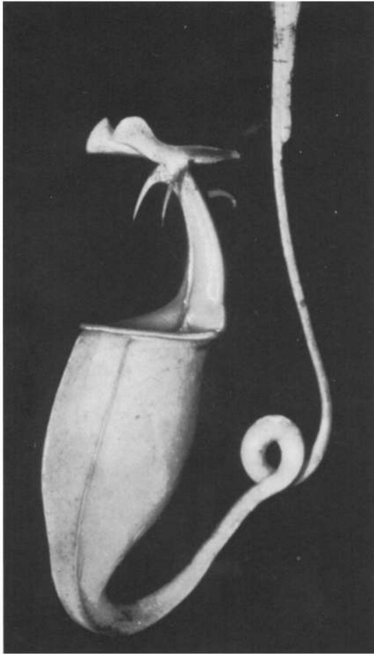
Nepenthes bicalcarata, a pitcher plant found in the peat forest.