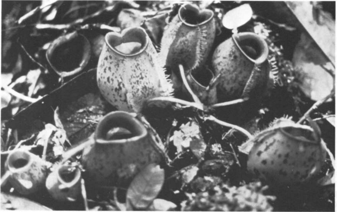
Nepenthes ampullacea , a pitcher plant common on the kerangas forest floor and often the home of mosquito larvae and frog tadpoles ( P. Leworthy ).