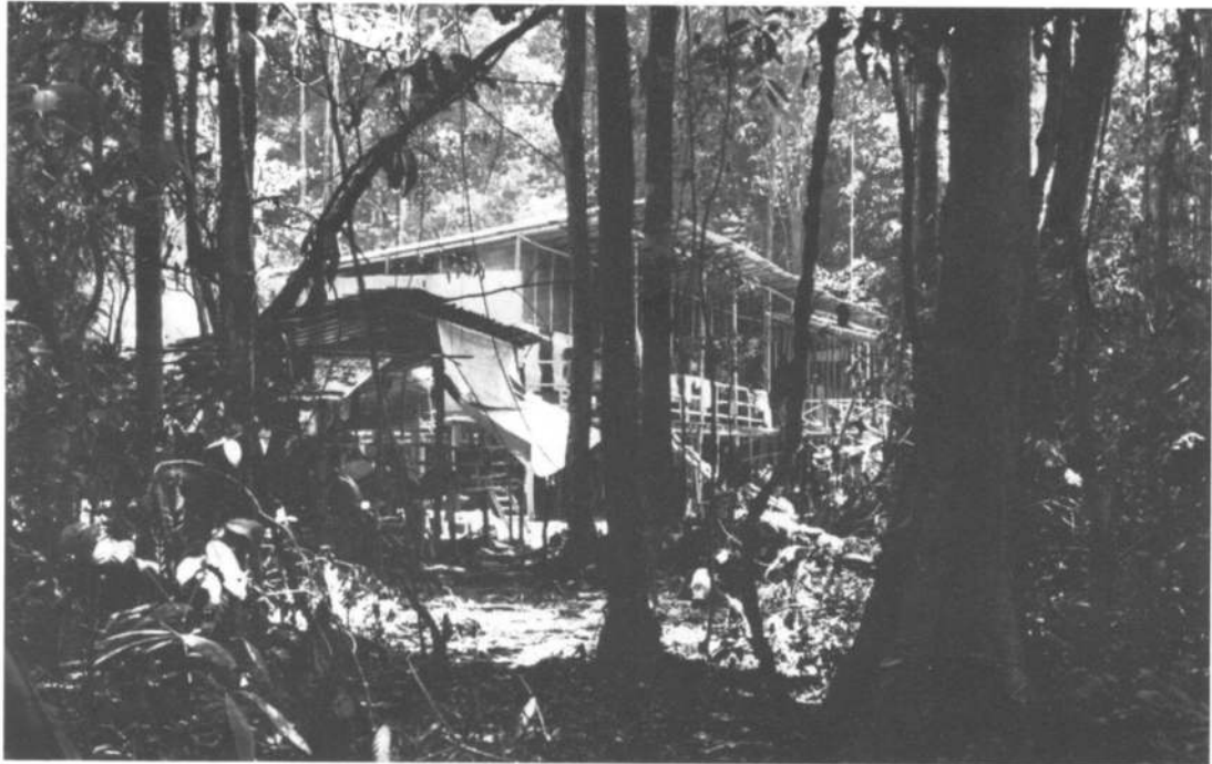
The Base Camp for the 15 month multi-disciplinary scientific research project of the tropical rain forest, situated on the edge of Gunung Mulu National Park.