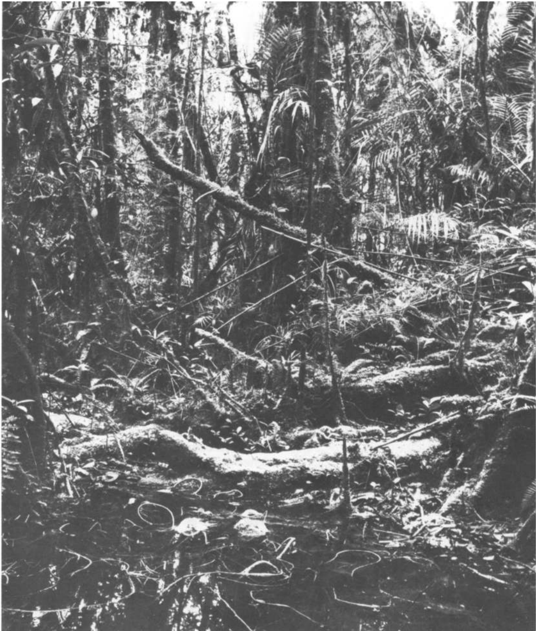
Gunung Mulu: lower montane forest ( Clive Jermy ).