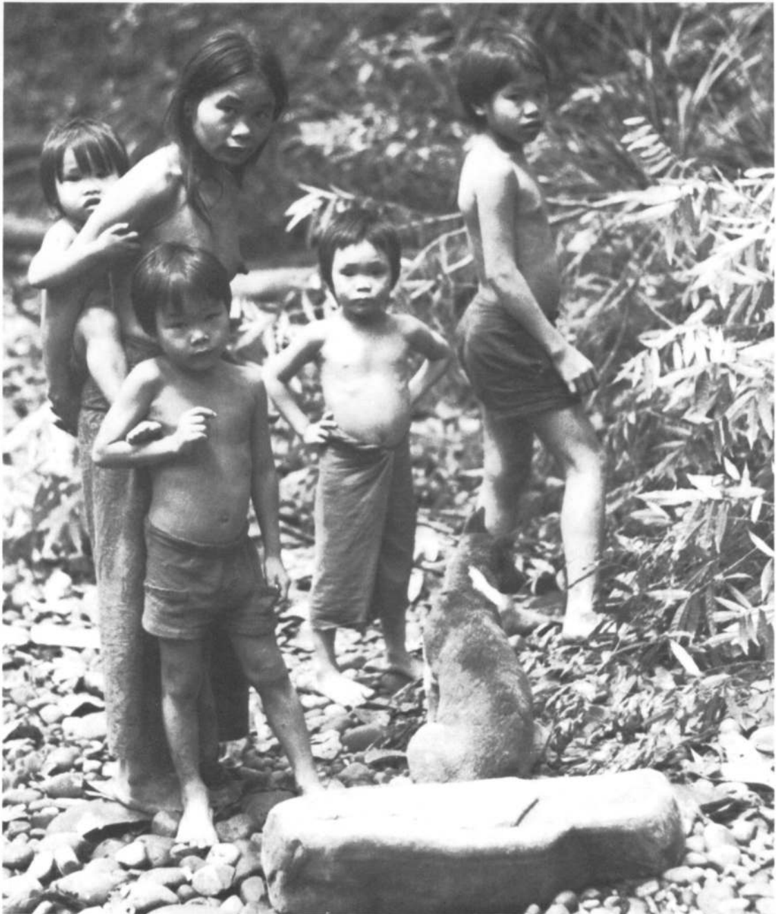
Penan family group: these people are an integral part of the ecosystem; cropping the natural resources sensibly they hunt a variety of animals for food, collect fruits and nuts and harvest wild sago ( Nigel Winser ).