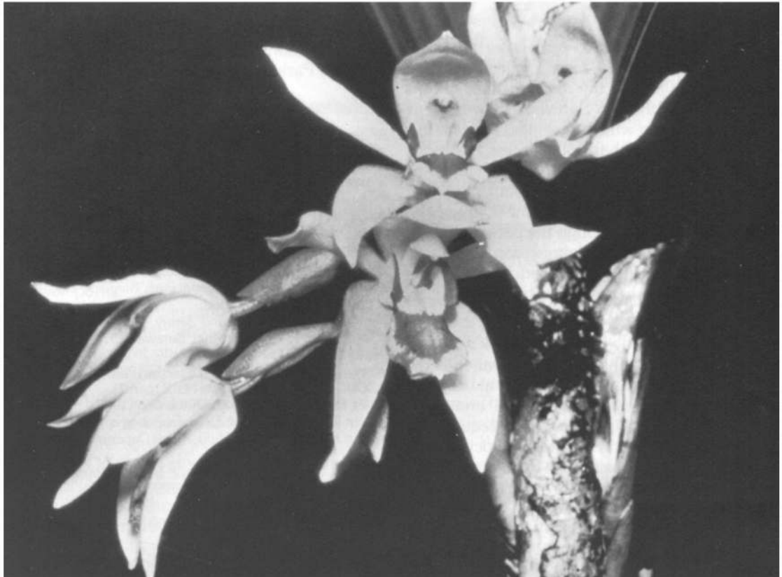
Coelogyne muluensis, an orchid recently described from the montane forest.