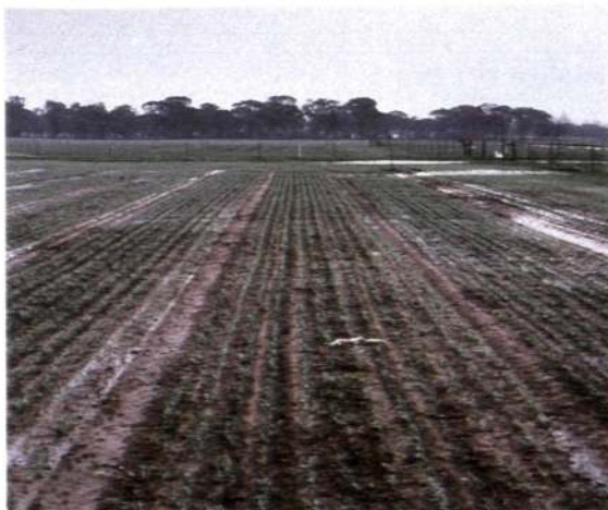
□ Poorly structured and well structured soil after gypsum treatment in a tillage trial at Merredin. Water no longer ponds on the treated soil.

An unstable soil will have most of the following features.