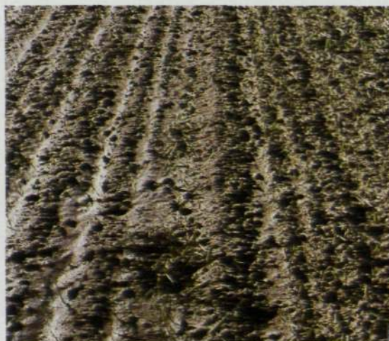
□ Poor soil structure in part of this paddock has influenced seedling emergence.