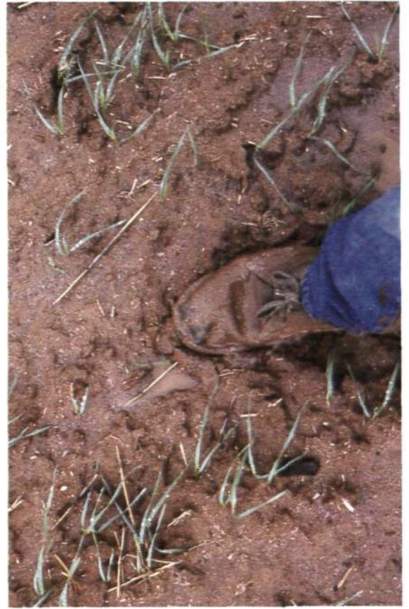
□ These photographs of a poorly structured and sloppy soil (left) and a well structured soil were taken on the same day. Water ponding on poorly structured soils is milky with dispersed clay.