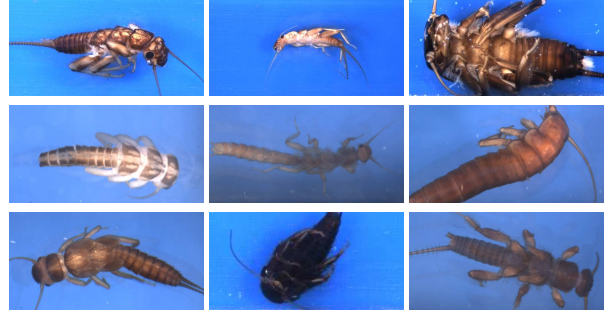
Figure 2. Example images of different stonefly larvae species in the STONEFLY9 dataset. From left-to-right and top-to-bottom: Cal, Dor, Hes, Iso, Mos, Pte, Swe, Yor and Zap. See [12] for the full species names.

The learning algorithm uses a standard SVM implementation with a specialized kernel. Consider the unnormalized matching kernel \tilde{K} for just one tree t . Let P and Q be the pair of HRF feature histograms computed across two images; then