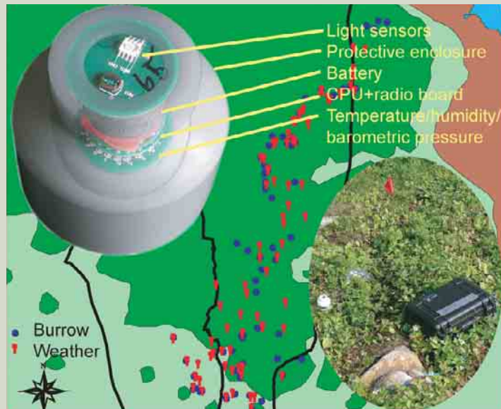
Great Duck Island deployment; a surface mote (detail) is associated with several underground sensors (red flags) and an infrared camera (black box).

logs data, queries, and network health statistics while automatically keeping a journal of the experiment. The TASK server is capable of running on a macrosensor. Deployment and in-the-field debugging are aided by a PDA-class device running a field tool application allowing for connectivity assessment and direct querying of individual sensors. The entire network is time-synchronized and duty-cycled to achieve low-power operation. C