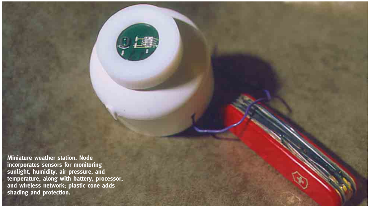
Miniature weather station. Node incorporates sensors for monitoring sunlight, humidity, air pressure, and temperature, along with battery, processor, and wireless network; plastic cone adds shading and protection.

Sensor nodes are small (only a few inches around) battery-powered devices installed in the areas of interest. A typical micronode is built around a low-power microcontroller running at a few MIPS with a few kilobytes of RAM. The sensing elements take the form of a probe connected to a general-purpose signal-acquisition board or are integrated into the packaging with microcontroller and wireless transmitter. Certain applications (such as acoustic bird-call classification) require macrosensors with additional computing power and storage. A typical macrosensor offers at least 10 times the capability—in terms of