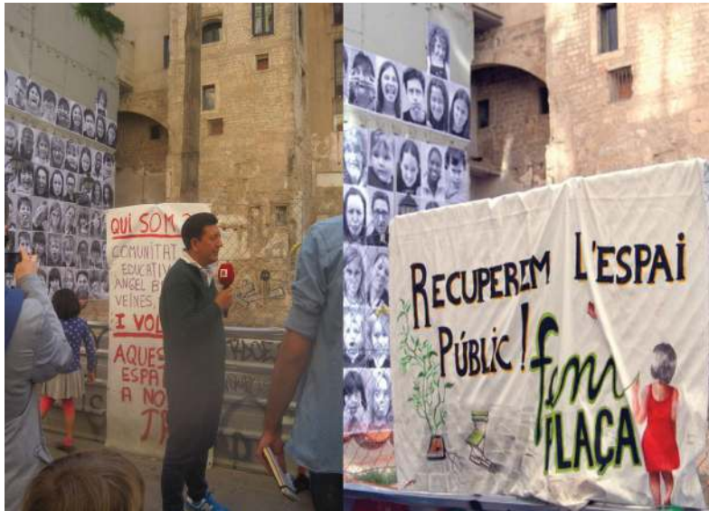
Figure 11. Sotstinent Navarro plot after the 4 th may when the AMPA Baixeras and Gothic neighborhood association organized a Fem Plaça action with the creation of the mural inside “In&Out” project of French artist JR. Image from BCNDistricte11.com and Apen Ruiz ( http://bendistricte11.com/2015/05/09/lescola-baixeras-i-lassociacio-de-veins-volen-participar-en-el-redisseny-urbanistic-de-ciutat-vella/#jp-carousel-989 .) [Accessed 12/16/2015].

We can follow some of the participant’s impressions on the blog site of the Yellow Comision from the AMPA Baixeras 20 . Here we can see different ways of expression and desires about what they ended calling: private, public and common space. We find a deep criticism to the touristic purpose attached to the project to make the “Promenade of the Walls” designed by the architect Josep Llinàs and developed by the Cultural Institute (helped by Archaeological Service) and the Urban Habitat Department of Barcelona. The inhabitants enjoyed this process not only of design but also for voicing a public criticism to past interventions and their rejection about the future use of this place as touristic attraction. On this case, participation turns into building up, not a common project (because of personal or different group interests), but a common voice of protest against the past unidirectional purposes coming from the administration. These actions became clearer during and after the second session when the neighbors met the images that the architects brought about the “Promenade of the Walls” where the plot was planned as an aisle space, far away from any kind of communal space.