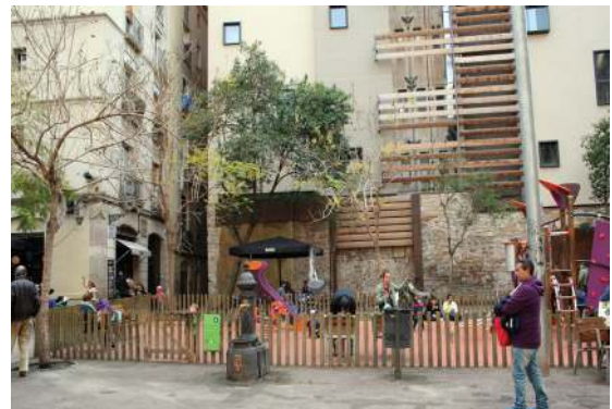
Figure 4. Playground and terrace. Behind it, we can see some remains of older constructions and the wood structure of a vertical garden placed on the backside of an administrative building. Ana Pastor.

LA COL 8 , Colectiu 9 Punt 6 or Paisaje Transversal 10 . It is in this Barcelona where I want to place my regard –now as a neighbor– discussing about the participative process that is currently taking place on a plot situated in the border of the Gothic neighborhood and the Born: Sotstinent Navarro , analyzed in the case-study section of this paper.