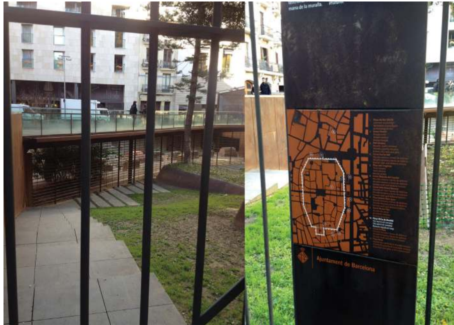
Figure 8. Pictures taken on the east side of the square where the informative stand is placed. Ana Pastor.

itants who were expropriated during the spring of 2010. Using the press as main source for the information regarding these interventions, we discovered that in 2012, there was a clear intention to demolish the surrounding buildings, one from a religious order and the other one privately owned, in order to enhance and include the Roman walls into the tourist circuit (Tarin and Angulo 2012).