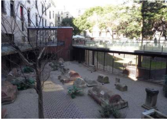
Figure 5. View of the archaeological remains took from one of the crystal fences that surround the Roman Funeral Way. Ana Pastor.