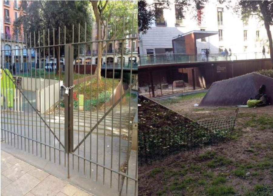
Figure 7. On the left, we can see the main entrance on Canuda Street; there is no readable schedule placed outside the park like also happens with the interpretation centre. On the right, we watch a homeless sleeping inside the closed park. Ana Pastor.

sonal history and they feel close to them, enjoying even a sense of place and privilege (aesthetic, symbolic and unique value) above other inhabitants in Barcelona. On the other hand, problems of insecurity in the past and a long period of works in the square, which have lasted more than ten years, had also impacted on their view of heritage, rising feelings of rejection towards the remains, and expressing a clear desire to see them transferred to the museum.