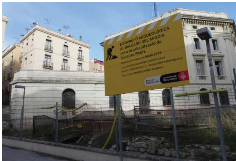
Figure 14. Works on the Bastion of Noon placed on the frontier between the neighbors of Barceloneta and La Ribera during 2014-2015.