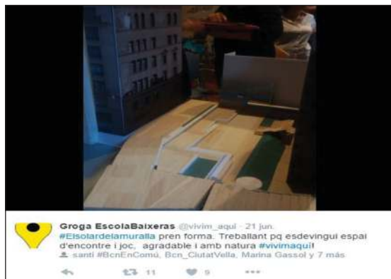
Figure 12. Tweet from the Yellow Commission from AMPA Baixeras with the date of 21 st of June.