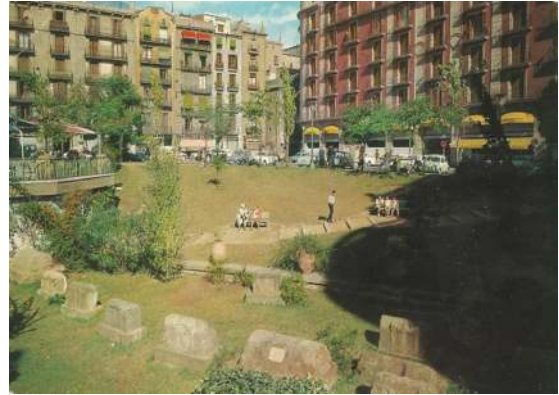
Figure 6. Image provided during one of my interviews to local residents and now accessible to everyone in the Blog: Barrinant la Plaça 1 . Roman Funeral Way in the 90's.

how they have been “used” by the authorities to create values (Alonso 2015: 30). In the case of the Temple of August, a simple view of its façade situates us in a multi-value experience. The different labels frame this monument at different times when the structure was enhanced, leaving the façade with an institutional horror vacui . Its official recognition as Place of Cultural Interest co-exists with an old tile or a new QR code, implemented by the guild of traders ( Fig. 2 ).