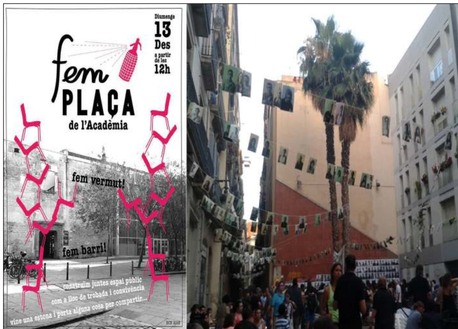
Figure 1. Poster of Fem Plaça (left), St. Joan's community Major Party organized by La Negreta del Gòtic on 2014.