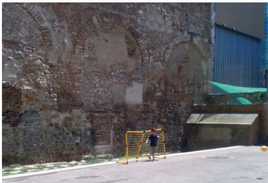
Figure 3. A boy playing football on the step made on the square for separating the monumental area from the playground and square-purpose area. Ana Pastor.