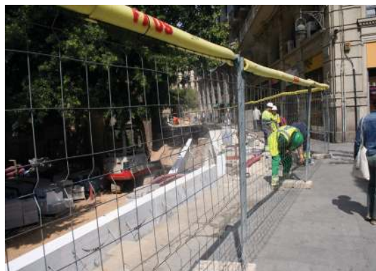
Figure 13. Laborers working on the construction of a “podium” to enhance the Roman Walls of Barcelona, street Tapineria, on May 2016.