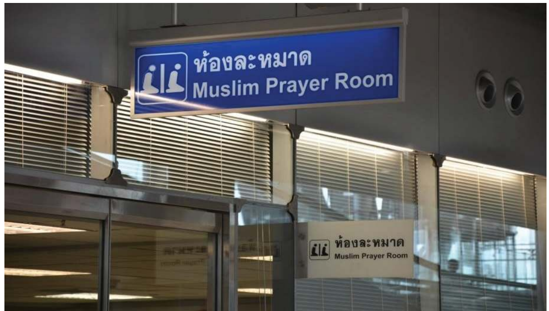
Figure 2: Muslim Prayer Room in Thailand.