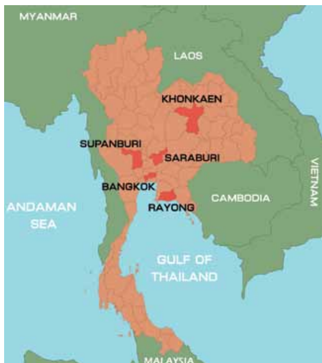
Figure 1. Location of sample collection sites during outbreak of hand, foot, and mouth disease, Thailand, January–October 2012.

During January–October 2012, a total of 847 samples were collected from 825 patients with suspected cases. Among those 825 patients, the diagnosis was HFMD for 672 (81.4%) and herpangina for 153 (18.6%). Patients' ages ranged from 1 month to 38 years. The samples were collected from hospitalized patients and outpatients who had a clinical diagnosis of HFMD or herpangina and who came from different parts of Thailand: Bangkok, 566 cases; Khonkaen, 252 cases; Suphanburi, 4 cases; and Saraburi, Rayong, and Chantaburi, 1 case each (Figure 1). Of the 847 samples, 695 were rectal swabs, 73 fecal, 39 throat swabs, 20 serum, 9 vesicle fluid, 7 nasal swabs, 3 cerebrospinal fluid, and 1 saliva. All samples, other than stool samples, were collected in virus transport media modified according to recommendations by the World Health Organization (12). Fecal samples were diluted 1:10 with phosphate-buffered saline and centrifuged, and the supernatant was collected for testing. Viral RNA was extracted from 200- \mu L samples