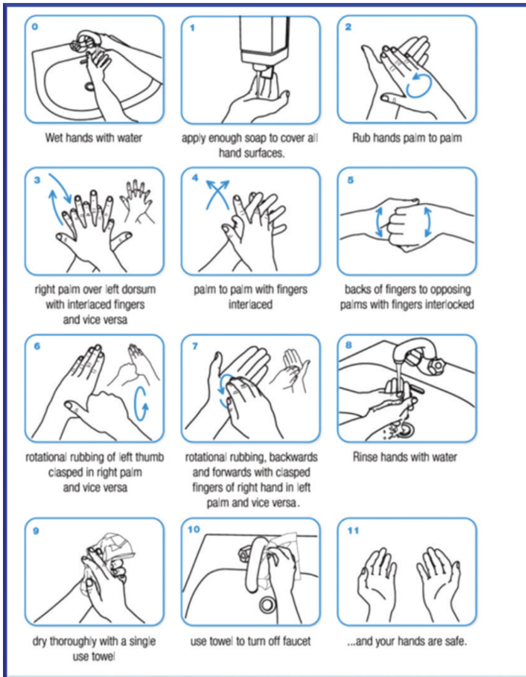
FIG 2. How to Hygienize Your Hands Precisely to Save Yourself from COVID-19 Infection. Source: United Nations. Handwashing/hand hygiene. Available from: https://www.unwater.org/water-facts/handhygiene/ (accessed June 6, 2020).