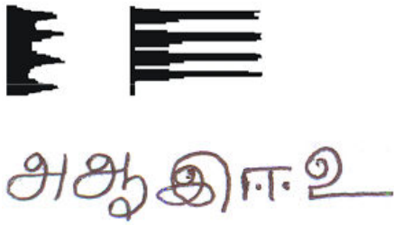
Figure 1. Histograms for skewed and skew corrected images, Original Texts