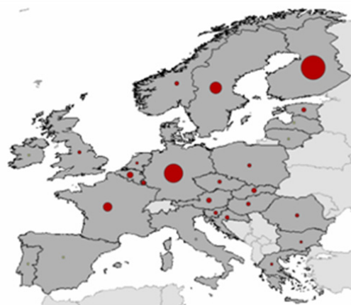
Figure 1 Spatial distribution of Hantavirus infections throughout European countries for the period 2008-2015 10

of patients being between 25-65 years old. 10 Their spatial distribution is shown on Figure 1.