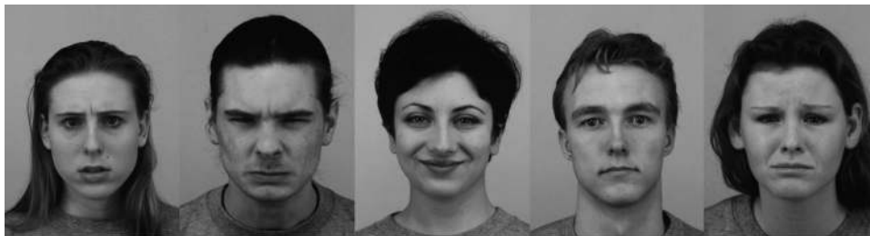
Figure 1. Exemplary stimuli (afraid, angry, happy, neutral, sad) chosen from the KDEF picture set (Lundqvist et al., 1998).

Eye movements were recorded by a monocular video-based, high-speed tracking system with 1250 Hz, (iView X Hi-Speed, SMI, Berlin, Germany). Participants were seated in front of the computer screen, the chin was placed on a chin rest to view the computer screen through the mirror-glass, which was used to reflect the eye, and the infrared light point tracked the eye movements with the camera placed above (for more details, see: Alpers, 2008). Location, time, and duration of all fixations were analyzed. Eight different areas of interest (AOI) were defined: forehead, left eye, right eye, left cheek, nose, right cheek, mouth, chin, and any other parts of the head. Fixations were defined as a gaze that remained in a diameter of 25 pixels for at least 100 ms.