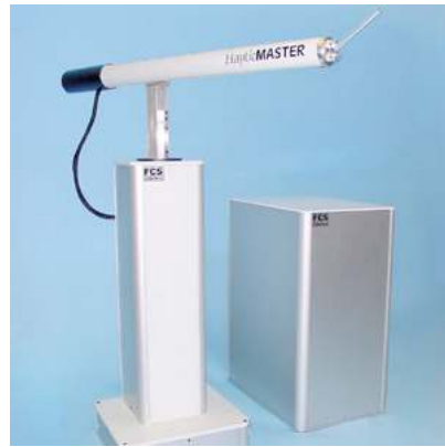
Figure 9. The HapticMaster from FCS Control Systems, unlike most devices, is an isometric device. It tracks a commanded displacement which is computed in response to a measured force applied by the user (admittance specification). It has three degrees of freedom, two of which are sliding joints.

Isometric Device. There are very few examples of isometric devices due to the design complexities resulting from the use of force sensors. Nevertheless, experimental devices were developed (MacLean and Durfee, 1995) and industrial systems exist (FCS Control Systems, see Figure 9).