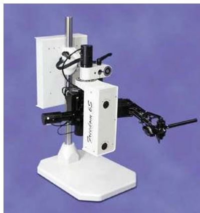
Figure 8. From MPB Technologies Inc., the six degree-of-freedom Freedom-6S provides uncanny virtual presence because of a very crisp response in all three translations and three rotations. The judicious specification of forces and torques makes it possible to precisely simulate interactions between tool and object taking place anywhere outside the physical extent of the handle: i.e. the tool is truly virtual.

Hybrid Kinematics. A six degree-of freedom device, extensible to seven, is described in (Hayward et al., 1998). It is characterized by a wide dynamic range and six-axis static and dynamic balancing. The primary user interface is a stylus but could accommodate scissor-like loops. Its design is "wrist partitioned", the position and orientation stages each being parallel mechanisms. The position stage is direct driven and the orientation stage is driven through remotizing tendons with a differential tensioning technique that operates with low tension and hence low friction. A commercial version 6 degree-of-freedom device is available from MPB Technologies Inc. (see Figure 8).