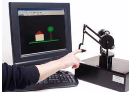
Figure 3. SensAble Technologies Inc. three degree-of-freedom Phantom™ 1.0, a common device for general research. The Phantom features a clever torque amplification capstan drive where only one cable is shared by two motors and provides for static balancing.

Point Interaction. The Phantom™ has become a popular device in research laboratories. There are several variants but generally a stylus is grasped, or a thimble braces the user's finger (see Figure 3). There are three actuated degrees of freedom and three sensed orientations. A typical configuration has a work volume of 2.7 cubic decimetres. A key design aspect is a capstan drive which avoids the use of gears and makes it possible to amplify the torque of small DC motors with a concomitant increase of damping and inertia. The initial design is described in (Massie & Salisbury, 1994) and is commercially available.