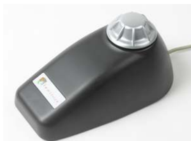
Figure 5. From Immersion Corp. a one degree-of-freedom device for navigation in user interfaces. This device represents an exercise in minimalism, yet it achieves a crucial function in that it substitutes touch for vision when integrated in a vehicle.

Rotary Controllers. A rotary knob with haptic feedback is also a device that is at the same time particularly simple and yet rich in research questions and applications (MacLean et al. 1999). A haptic knob has been developed and commercialized by Immersion Corp. for vehicles (See Figure 5).