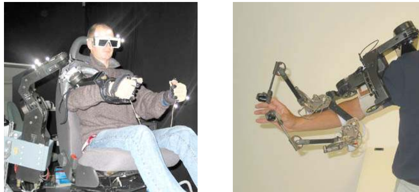
Figure 2. The PERCRO Laboratory (Scuola Superiore di studi Universitari S. Anna, Pisa, Italy) has extensive experience with the development of exoskeleton-type haptic interfaces. The left panel shows such a device applied to the simulation of the driving experience for cockpit design optimization. The right panel shows a variant of this device accommodating two additional sub-devices able to simulate the manipulation of objects “out of thin air”.

Exoskeletons. The exoskeleton devices developed by Bergamasco and co-workers incorporate many observations regarding the human biomechanics. To achieve wearability, the system uses a variety of techniques including motor remotizing, sophisticated cable routing, and friction reduction by feedback (Bergamasco et al., 1992). Being worn, the device body interface is partly bracing and partly held. Many other devices have been designed by this laboratory (see Figure 2 for recent developments).