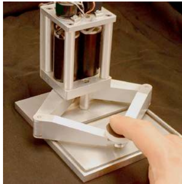
Figure 4. From McGill University Haptics Laboratory, the planar workspace Pantograph allows for the simulated exploration of surfaces. The interface neither needs to be grasped nor does it need to brace a finger. Simplicity yields high fidelity: the frequency response is flat to 400 Hz, it has three orders of magnitude of dynamic range, and resolves 10 \mu\text{m} displacements.

Horizontal Planar Workspace. The Pantograph (Hayward et al., 1994), has been made in many variants, which were characterized by simplicity and a uniform peak acceleration ratio contained in a 3 dB band. It has two actuated degrees of freedom in the horizontal plane, provided by a stiff parallel linkage driven without transmission. The finger rests on the interface, resulting in a unilateral interaction (see Figure 4). One variant is operated by the thumb and fits in the hand. Larger ones have a working area of 1.6 square decimetres. An industrial version, the PenCat/Pro ™ , has a sensed 2.5 cm vertical movement, passively actuated by an elastic return.