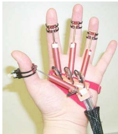
Figure 6. From the Human-Machine Interface Laboratory of Rutgers University, the Master II-ND virtual reality force-feedback glove (new design). The use of pneumatic pistons makes it possible to achieve a low weight and hence a portable device to simulate the grasping of virtual objects.

Virtual Reality. Burdea and co-workers have pioneered a concept whereby pneumatic, force-producing elements act on discrete areas inside a user's hand. Portability makes the design adequate for use in conjunction with virtual reality gloves (Burdea et al., 1992, see Figure 6). Performance modeling is described in (Gomez et al., 1995).