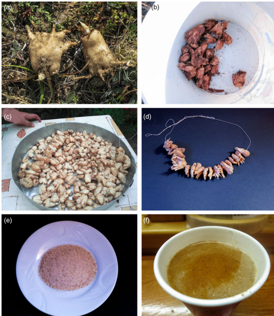
PLATE 1 Freshly collected tubers of Dactylorhiza sambucina from Zagorohoria (a) and Grevena (b); tubers of Dactylorhiza sambucina left to dry in Distrato (c); dried tubers for home use in a village in Grevena (d); ground salep in Distrato (e); and salep beverage for sale near a ski centre (f).

harvested in Greece. Another company operating in the Greek domestic market sold ground salep mixed with corn starch and common spices, such as cinnamon, nutmeg and cloves. The packaging labels claimed that the salep was sourced from cultivated stock but we found no evidence for this. Based on information from informants we established that packaged salep may retail for up to EUR 143 per kg (based on a price of EUR 5–10 for 60–70 g).