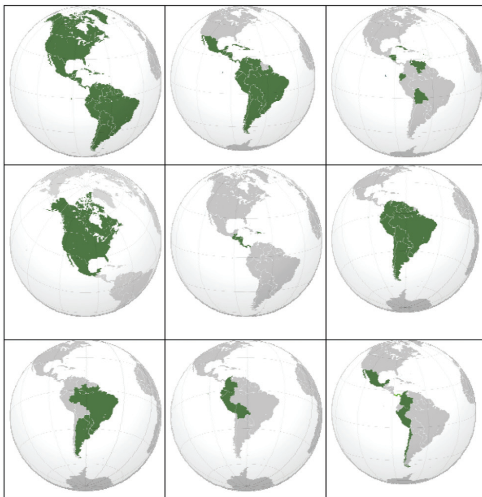
FIGURE 2. Latin America: decentralised regionalisms

From top left, reading wise: (1) the Americas, (2) Latin America, (3) ALBA, (4) North America (NAFTA), (5) Central America (SICA), (6) South America (UNASUR), (7) Mercosur, (8) Andean Community, and (9) Pacific Alliance.