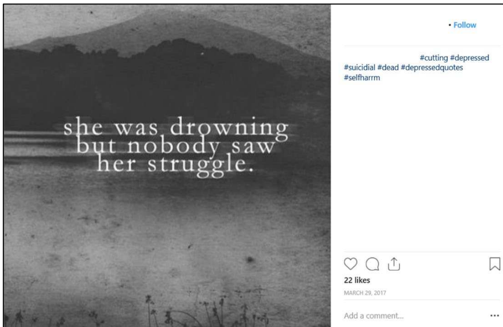
Figure 2: An example of a negative Inspiration post and the 'sad' aesthetic.

Aestheticised content of this kind is 'connectable' and consistent, enabling the affiliation capacities associated with hashtag use. Zappavigna calls this kind of communication 'ambient affiliation': how 'virtual groupings afforded by features of electronic text [...] create alignments between people who have not necessarily directly interacted online' (2012:1). Most often, these posts were associated with accounts we categorised as 'dedicated' accounts, set up with the aim of posting a consistent type of material associated with aspects of depression (whether positive or negative). The beauty of hashtags is that they connect people who are not typically connected to each other. The unique aesthetic of #depressed posts that we have uncovered here – along with the aesthetics of untagged posts relating to depression – are easily recognisable, and users who have never communicated before can instantly share their experiences through their tagged posts. Baym explains that online communities are often formed through such shared practices; that is, they can be found in the 'routinized behaviors' that groups members share, and which include 'insider [...] genres, styles, and forms of play' (2010:73).