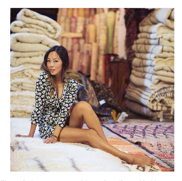
Figure 3. Instagram image of Aimee Song (Song of Style) on a trip to Morocco, sponsored by fashion brand Diane von Furstenberg.

travel, and frequent event attendance (on top of regularly creating blog content) is artfully displayed on social media, obscuring the work that goes into obtaining and maintaining the production of the self-brand.