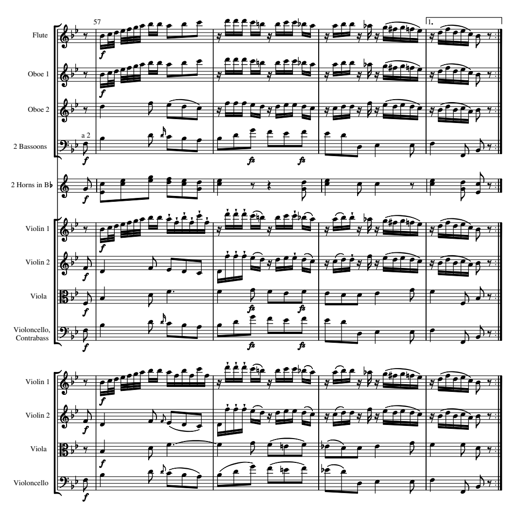
Example 4 Symphony No. 84/ii, bars 57–60 ( Joseph Haydn Werke , series 1, volume 13: Pariser Sinfonien , 2. Folge , ed. Sonja Gerlach and Klaus Lippe (Munich: Henle, 1999)). Used by permission. Quartet: Artaria (1788)

The complete autograph scores of two of the symphonies, Nos 84 and 86, survive.<sup>37</sup> Two instances of second thoughts in the autograph score of No. 84 are revealing. Example 4 presents the symphony version and the quartet version of a passage from the Andante. The most significant difference is the change in the thematic bass line in bar 58, from E_{\flat} in the symphony to E_{\natural} in the quartet. At this point the autograph score of the symphony contains evidence that something was erased before this note; that it was a natural sign is suggested by another erasure in bar 59 before the first note, probably of a cautionary flat sign.<sup>38</sup> The compositional history of this change in the autograph score of the symphony is easily reconstructed. The movement is a set of variations that had contained this E_{\natural} in the original theme (bars 2 and 6) and most of the equivalent points in the two major-key variations (bars 30, 34, 46 and 50). (The first variation is in the tonic minor and, consequently, harmonically recast.) When Haydn came to write the thematic line in bar 58,