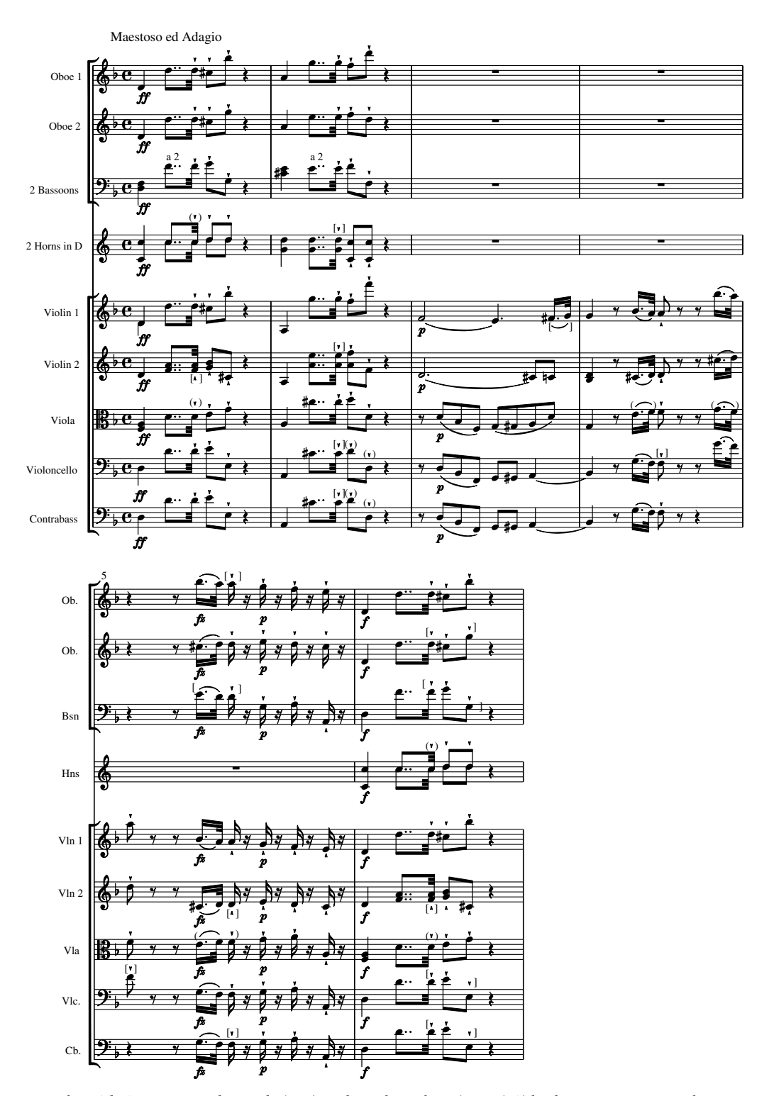
Example 1 The Seven Last Words, Introduzione (Joseph Haydn Werke, series 4, Die Sieben letzten Worte unseres Erlösers am Kreuze, Orchesterfassung, ed. Hubert Unverricht (Munich: Henle, 1959)). Used by permission