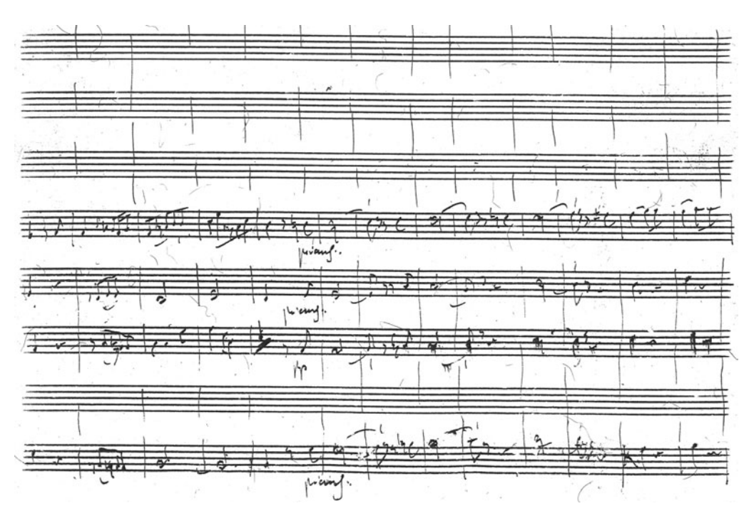
Figure 2 Page from the autograph manuscript of Haydn, Symphony No. 84/iv, bars 215–217. Paul Sacher Stiftung, Basel. Used by permission

bass line) has an E $\sqrt\$ in bar 58 of Example 4 and, consequently, a cautionary E $\sqrt\$ in bar 59; and in the finale the length of the note of resolution in the various string parts is mainly crotchets. This line of transmission – from autograph score via manuscript parts to printed parts – would allow the earlier theory that the subsequent quartet version was instigated by Artaria and was based on a new score prepared from either the manuscript parts or the recently engraved orchestral parts.