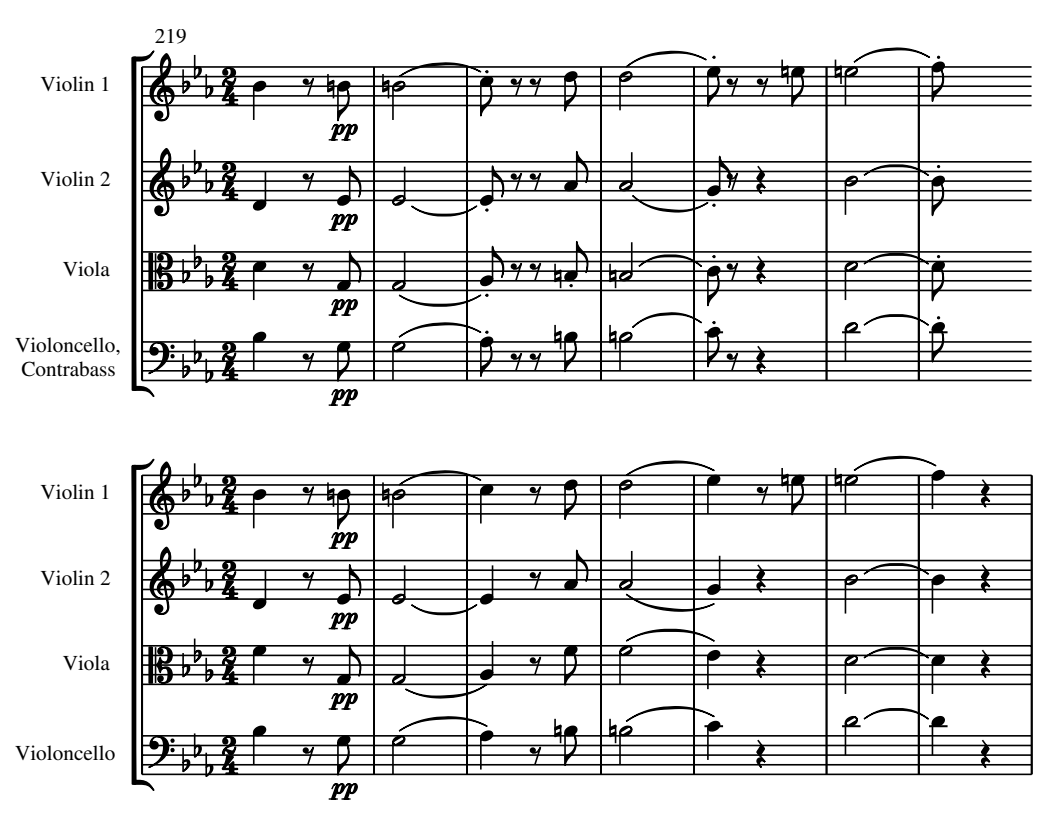
Example 5 Symphony No. 84/iv, bars 219–225 ( Joseph Haydn Werke , series 1, volume 13: Pariser Sinfonien , 2. Folge , ed. Sonja Gerlach and Klaus Lippe (Munich: Henle, 1999)). Used by permission. Quartet: Artaria (1788)

his first thoughts were to use the E atural but the decorative semiquaver patterns in sixths in the upper voices were producing clashing E atural s; to avoid the semitone dissonance he erased the natural sign in the autograph and the now redundant cautionary flat sign in the following bar. In the quartet version the E atural survives.