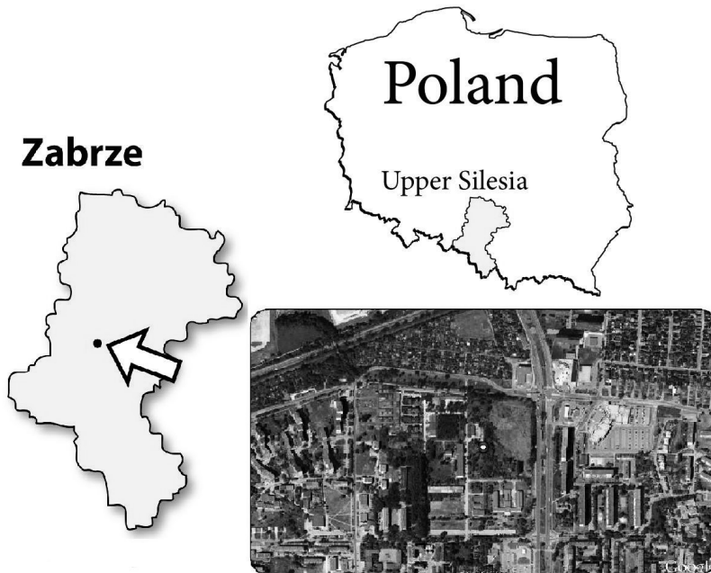
Fig. 1. Location of sampling site

The site, selected in Zabrze for the experiment, is representative of the typical air-pollution conditions in the central part of Upper Silesia – by the Directive 2008/50/EC definition [7], it is an urban background measuring point (Fig. 1). The effects of the industrial and municipal emissions on living quarters of the agglomeration are represented and may be observed very well there.