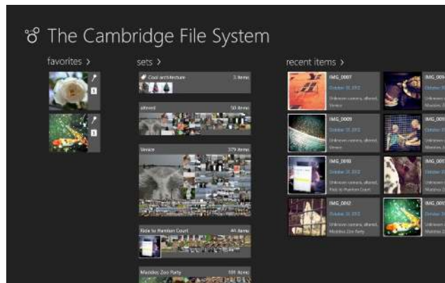
Figure 1. CamFS home page.

Upon opening CamFS, the user is presented with a homepage displaying three groupings of objects: a group of Favourite items, a collection of recently interacted with sets, and a collection of recently interacted with items (see Figure 1). On first use, the Favourites section is empty, and recent items are organised according to the dates in CamStore.