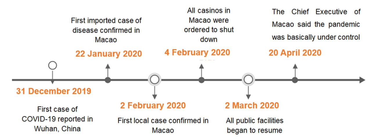
Figure 2. Timeline of the key events of the COVID-19 pandemic in Macao (1 January to 31 December 2020).

erage number of 547 posts per day were made. This period has witnessed the highest frequency of discussion over the 12 months. Online discussions on COVID-19 peaked at over 1000 posts on 4 February 2020, when all casinos and other entertainment facilities in Macao were ordered to shut down [46]. On 20 April 2020, the Chief Executive announced that the pandemic was under control. Following this, the government lifted restrictions and resumed all public facilities. Subsequently, discussions on COVID-19 began to diminish and plateaued by the end of the year, with an average of 217 posts per day (n = 55,412). A timeline depicting the key events of the COVID-19 pandemic in Macao is presented in Figure 2.