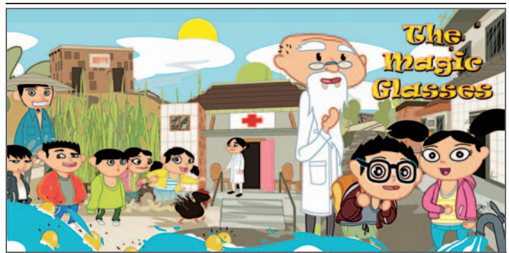
Figure 2. Cover of the Cartoon "The Magic Glasses."

We estimated a design effect of 1.1 on the basis of preliminary survey data from 74 students across 4 schools in the study area. We then estimated the sample size that would be required for an individually randomized trial 9 and multiplied the result by the design effect. Assuming an incidence of infection with soil-transmitted helminths of 6% (which is typical of communities in which the prevalence of such infection is 18%), we esti-