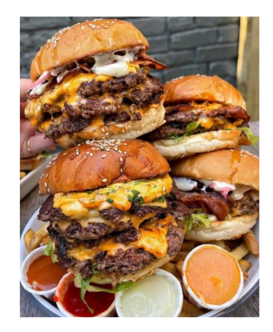
Figure 1. Example image of food from Twitter [5].