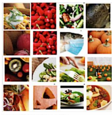
c. Definitively Healthy