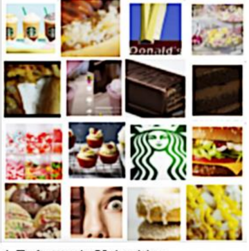
d. Definitively Unhealthy