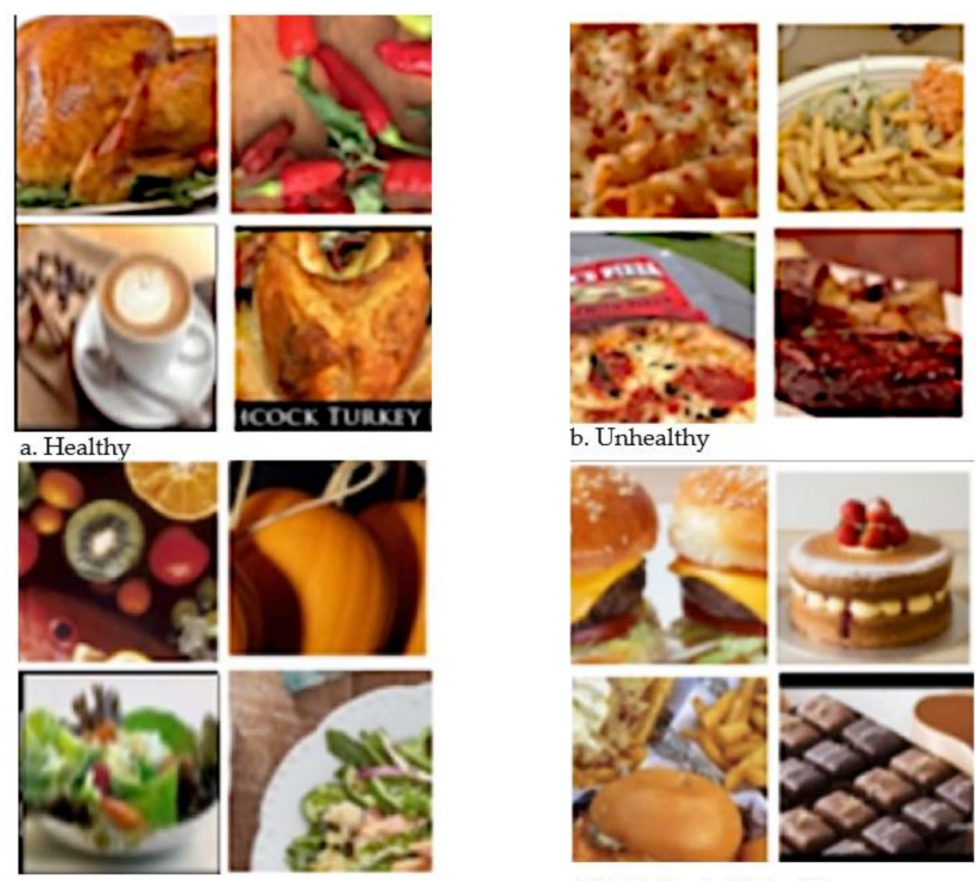
c. Definitively Healthy

The model is further tested on twitter images that were collected using the twitter API. We then manually selected images that contained food items from previous literature [20]. Examples of prediction are shown in Figure 4. The bottom right contains images of chocolate, cake and burger which are in the definitively unhealthy category. The bottom left consists of pumpkin, fruits and salad which are in the definitively healthy category. The top right has the images of turkey, chili and coffee which are in the healthy food category. The top left shows pizza, fries and roasting images which are unhealthy food items.