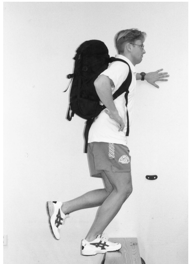
Figure 2. Increasing the load by adding weight in a backpack.

The Wilcoxon signed rank test was used to evaluate differences between the injured and noninjured sides and