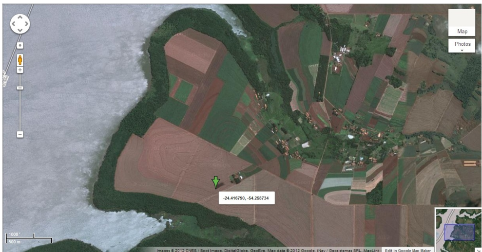
Figure 3. Local where the experiment involving fertilization with Zn in corn crop was performed [80]

used in the work, it was observed that one of the sources presented 11039.46 mg of Pb kg -1 , being the maximum limit permitted by Brazilian law (NI 27/06) [37] 10000.00 mg of Pb kg -1 (Table 3). However, as previously mentioned in the section 3, the NI 27/06 tolerates the presence of contaminants up to 30% of the maximum permitted value, in this way, the fertilizer would not be considered as irregular, and can be freely traded.