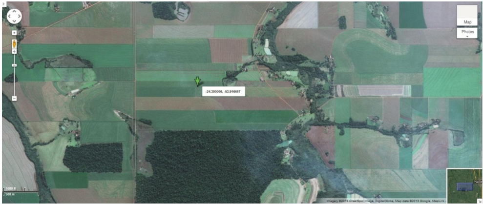
Figure 2. Local where the experiment involving fertilization with Zn in soybean and wheat culture were performed [80]

used in the work, it was observed that one of the sources presented 11039.46 mg of Pb kg -1 , being the maximum limit permitted by Brazilian law (NI 27/06) [37] 10000.00 mg of Pb kg -1 (Table 3). However, as previously mentioned in the section 3, the NI 27/06 tolerates the presence of contaminants up to 30% of the maximum permitted value, in this way, the fertilizer would not be considered as irregular, and can be freely traded.