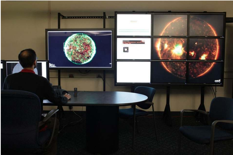
Figure 4 HiPerSpace data wall controlled by EVACS/Panorama.

and resolution are dependent both on the method that found the data and the type of feature reported. The resulting movies and ancillary data are web accessible with references in the HER.