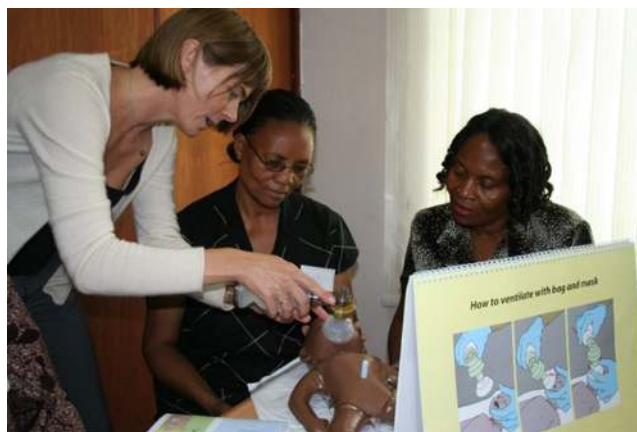
Pilot testing of Helping Babies Breathe 1st Edition in Dar es Salaam, Tanzania.

Lifesaving skills, such as bag-mask ventilation, often require more practice time, focus, and supervision than can be provided in a single-day workshop.