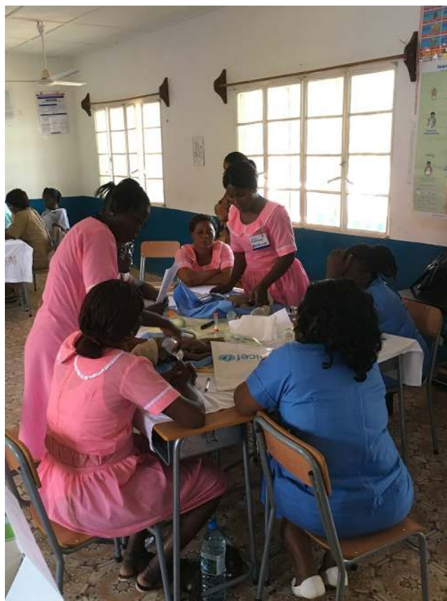
Field testing of Helping Babies Breathe 2nd Edition with MNCH aides in Kabala, Sierra Leone.

The global community must remain committed to introducing practices that will accelerate the reduction of overall neonatal mortality in order to meet the goals of the Every Newborn Action