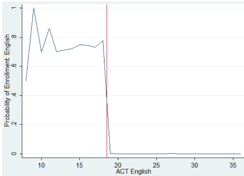
Figure 1: Probability of Enrollment in Remedial Courses by ACT Subject Score