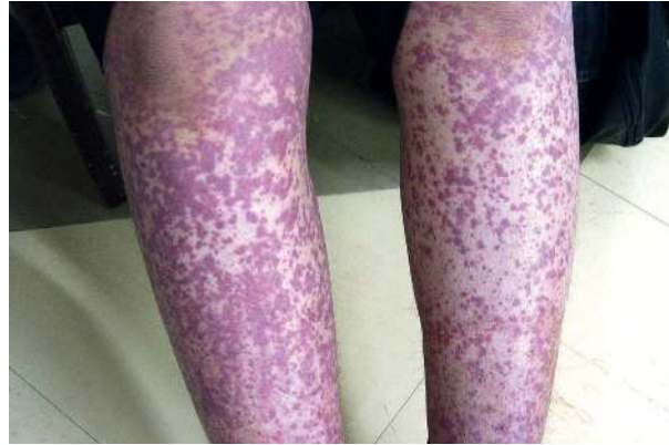
FIGURE 1: Palpable purpura with more intensity on the lower extremities.