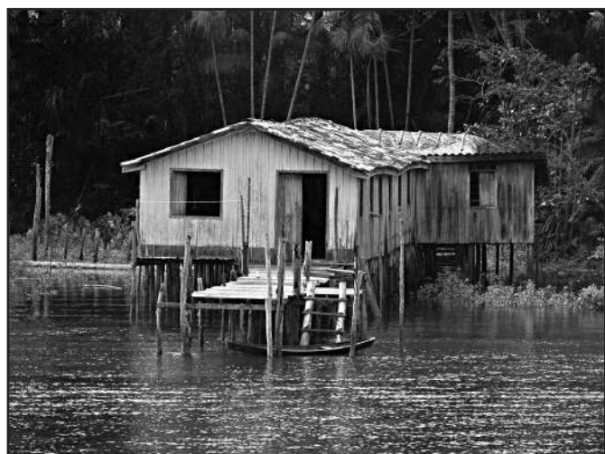
FIGURE 2 - Riparian's community house on Pacuí island, Cametá, Belém, State of Pará, Brazil.