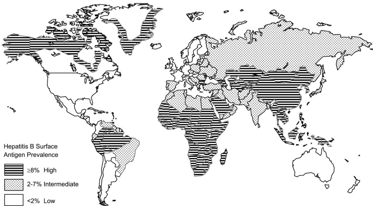
FIGURE 1. Geographic distribution of the prevalence of chronic hepatitis B virus infection, 2002. (Source: Mast et al. (28).)

4.9 percent had serologic markers of previous or current HBV infection (66). In the prevaccine era, some indigenous populations and immigrant groups within the United States had seroprevalence rates similar to those of highly endemic countries, and members of these populations comprised a disproportionate share of new HBV infections nationwide (27). Studies conducted in the 1980s among Southeast Asian families recently settled in the United States found that 5–10 percent of children aged 1–10 years and 15 percent of children aged 11–20 years were chronically infected (67, 68). Among Alaska Native children living in Alaska in the 1970s, 15 percent had serologic evidence of infection and 6 percent were chronically infected (7, 69).