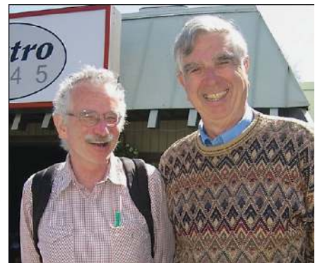
Doron Zeilberger, Herb Wilf, Gainesville, 2005.

One day during dinner at the famous Moosewood Restaurant in Ithaca, NY, Herb took me and Doron aside and proposed that we write a book about automated proofs of identities involving hypergeometric sums. We agreed, and Herb drafted the table of contents for nine chapters, which we divided