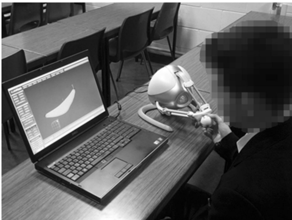
Fig. 1 A participant using CRE8 with the Novint Falcon to model an organic geometry

Subsequent to this design activity the participants were required to model a prescribed organic geometry using the same designated CAD system as before. This activity was introduced because it was envisioned that during the previous design task participants could conceive an idea which was within their capacity to model and therefore not present any problematic activity, consequently preventing an investigation into the heuristics they would exhibit. While the geometry of the organic stimulus was a familiar geometry, not having any prior influence on its design suggested an increased potential for problems to occur during the modelling task.