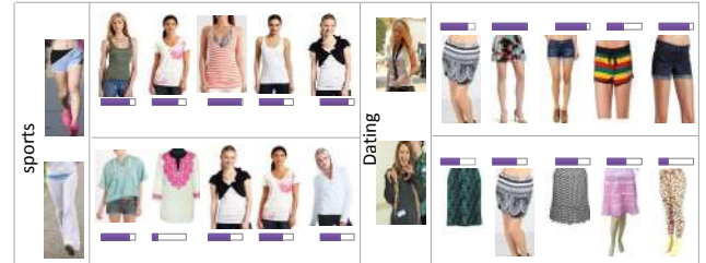
Figure 3: Some exemplars of the clothing pairing results, given an occasion and one reference clothing. The most favored clothing for each occasion are shown in descending order. Their groundtruth scores are shown nearby.

Here, we evaluate the effectiveness of magic closet in occasion-oriented clothing pairing . From Figure 3, we can see that most of the returned clothing match the query and the specified occasion quite well. For the “dating” occasion, the first query is “short sleeve”, and the top 5 returned clothing are either “mini skirt” or “shorts”. For the second query in “dating”, which is “long sleeve” and thick, therefore, the recommended lower-body clothing are “normal-length skirts” or “pants”. These results clearly demonstrate the advantages of the magic closet in the clothing pairing scenario.