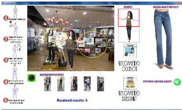
Figure 2: The interface of magic closet.

as trousers/skirt) to match with user’s upper-body clothing (such as Tees/Coats). (3) Then user holds one’s hands together to notify magic closet to capture a photo. After 3 second countdown, magic closet will take a picture of the user. (4) The instantly captured picture is sent to the server-end for further analysis. The recommended clothing will be sent back from the server-end back to the client-end in several seconds. (5) The recommended clothing can even be fitted upon users’ body. Therefore, users can try the clothing and check whether it is indeed suitable for the occasion as well as the reference clothing.