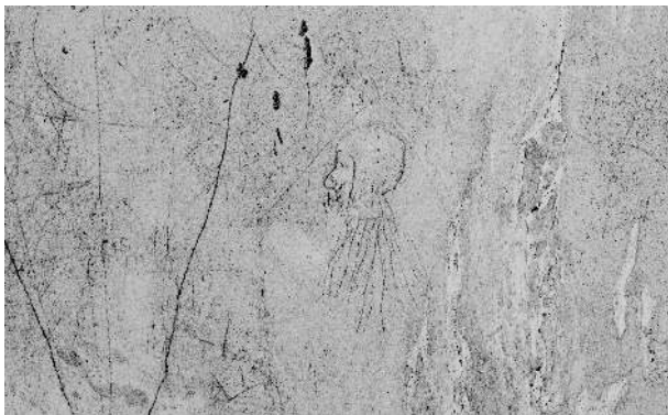
Figure 6. San Marco Basilica, pillar, orthophoto, Doge's head detail, RGB (top) – change-detection (bottom)

In normal environmental condition (indoor spaces), indeed, graffiti detection with naked-eye is challenging, and often the traditional methods fail. Moreover, although the application of photogrammetry and RTI have improved visible graffiti documentation, the present contribution brings the research a step forward. Exploiting remote-sensing born algorithms, it has been demonstrated how it is possible not only to enhance visible graffiti but also to locate non visible ones.