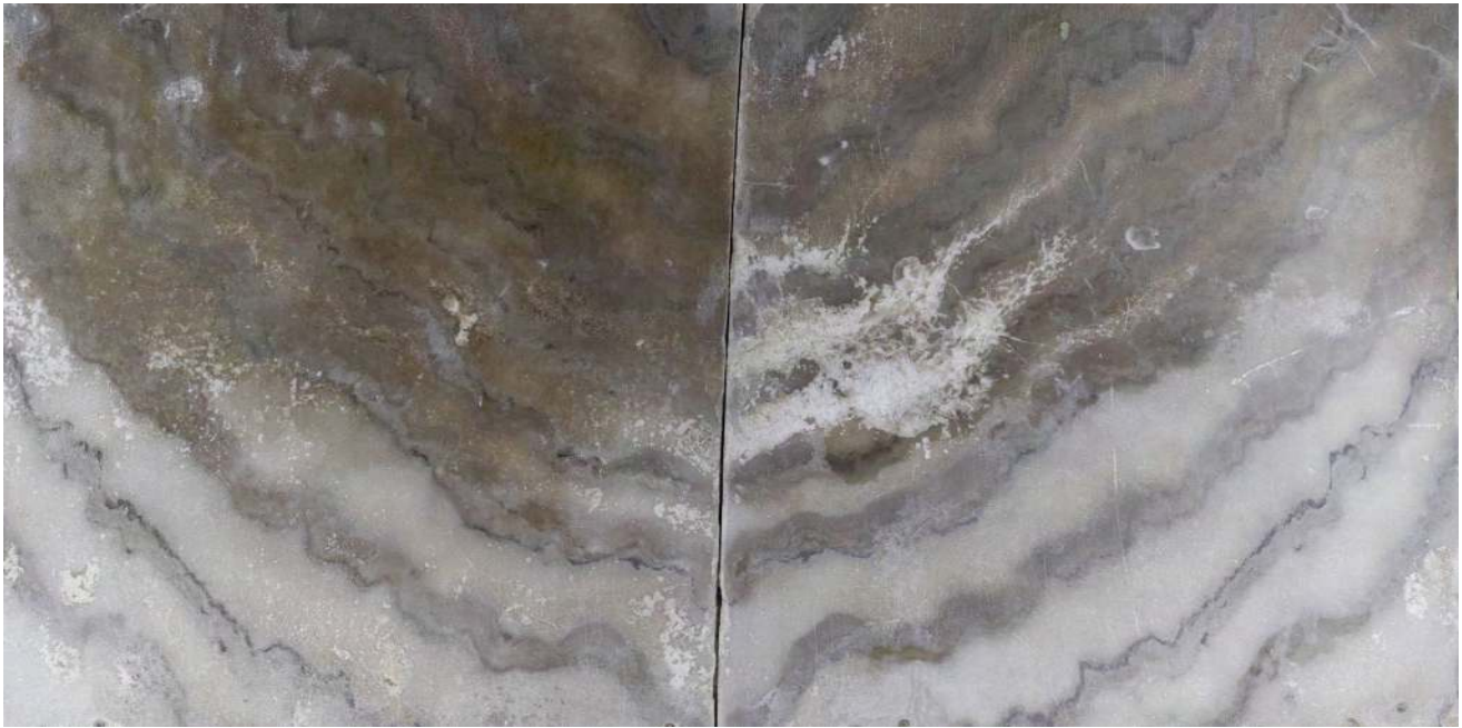
Figure 4. San Marco Basilica, western wall of the southern transept, RGB orthophoto

It is anticipated that, due to the intrinsic features of the marble slabs used in San Marco, and characterized by linear veins, the algorithms created several artefacts which were discarded by manual and visual inspections at a later stage.