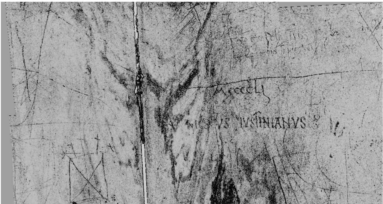
Figure 7. San Marco Basilica, pillar, orthophoto, inscription detail, change-detection

The Doge's head, identified as such thanks to the characteristic corn hat, has a very small dimension which did not allow the identification with the naked-eye. The proposed methodology allowed to recognise it with a high level of definition, recording every detail.