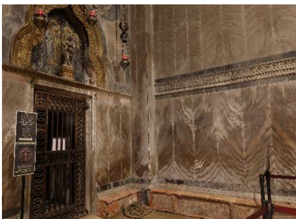
Figure 2. San Marco Basilica, south transept, marble decoration.

These locations are also still enriched by the presence of marble benches. The presence of the latter has been considered as an important element that could foster the making of graffiti by providing the carvers with a comfortable position that could have allowed them to realize, undisturbed, not only simple drawings but also extended portraits, scenes and inscriptions (Figure 2).