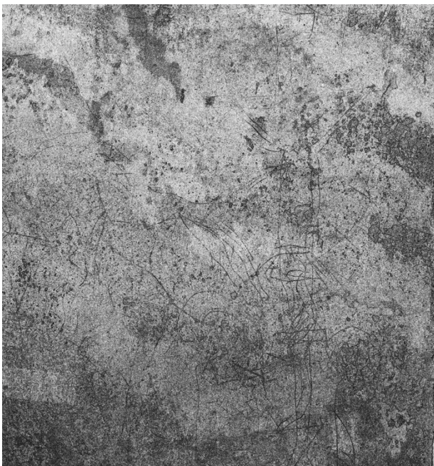
Figure 5. San Marco Basilica, western wall of the southern transept, orthophoto of the Crucifixion scene, edge-detection

It is anticipated that, due to the intrinsic features of the marble slabs used in San Marco, and characterized by linear veins, the algorithms created several artefacts which were discarded by manual and visual inspections at a later stage.