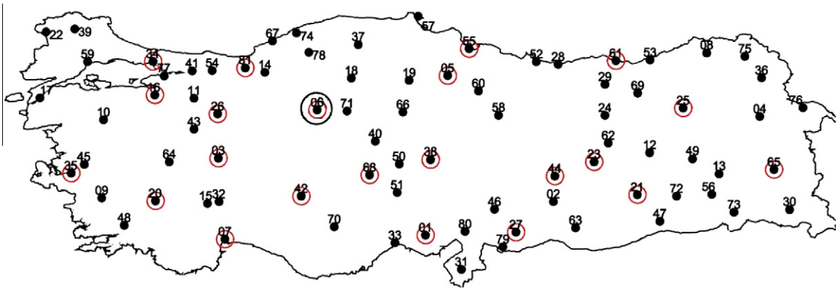
Fig. 2. 81 Cities, 22 potential hub locations, and the central airport hub on the Turkish network.

connection between an airport hub and Ankara is estimated as 3500. We varied the values of the fixed costs of operating truck and airline connections in order to observe the effects on the optimal solutions.