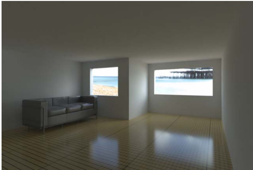
Figure 2 LuxRender rendering with HDR sky background

One of the advantages of the panorama technique of HDR generation is the high quality of the final image. This allows the generated light probe to be not only the light source for a virtual scene but also the background, placing the student's virtual design very much in its correct geographical context.