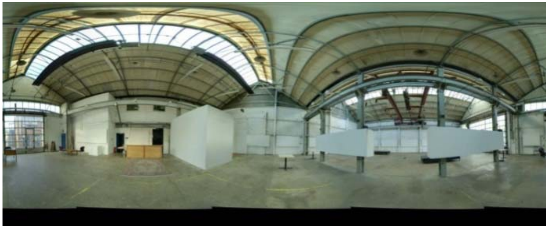
Figure 1 Final tone mapped HDR panorama of an interior scene.