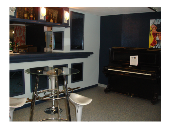
Figure 1 Simulation of a crime scene in a discotheque (C Police Academy of Savatan Robin Uldry).

resource management and found that most aviation accidents involved factors such as lack of leadership, coordination, or decision-making. The National Transportation Safety Board later developed the Cockpit Resource Management module which is based on group dynamics, leadership, and decisionmaking processes.<sup>5</sup> By the end of the 1980s, the concepts of "teamwork" and "cockpit resource management" were widespread among Western airline companies and became the official standard recommended by the International Civil Aviation Organization for all commercial airlines. In 1986, "cockpit resource management" was renamed "crew resource management" (CRM) to reflect its extension to all flight personnel, and includes additional notions such as stress management and information-sharing.<sup>6</sup>