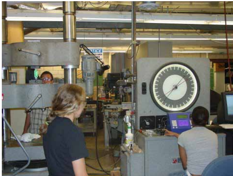
Figure 1: Tensile testing of steel alloys

In the 10-week project, the students designed, assembled, and launched a tethered intelligent balloon assisted by two undergraduate students, one in mechanical engineering and the other in electrical engineering. The balloon