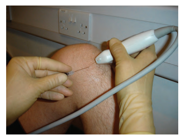
Figure 2. High Volume Image Guided Injection of Proximal Patellar Tendinopathy.