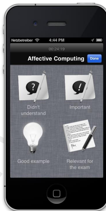
Figure 2: Exemplary GUI of an app that allows for basic annotations during the lecture, containing only four types of labels/tags. Lecture time and title is given in the header of the GUI.

tions, or cannot be contacted individually. Here, modifications are easily conceivable. The main purpose of the above given outline is to provide the reader with an idea of the system we have in mind when we now describe the non-technical requirements we see for it to work.