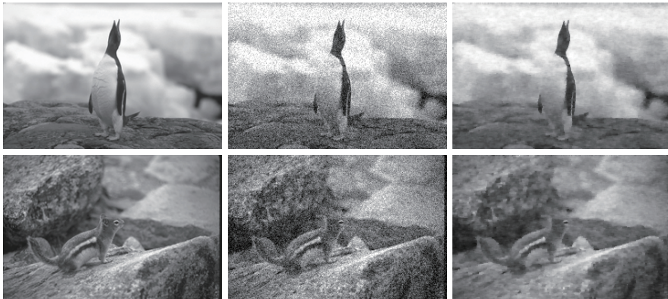
Figure 2. More image restoration results. (Left column) Original images. The size is 240 \times 160 pixels. (Middle column) Noisy images ( \sigma = 20 ). PSNR=22.63 and 22.09 from top to bottom. (Right column) Restored images. PSNR=30.92 and 28.29 from top to bottom.