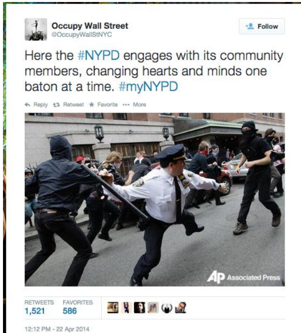
Figure 2. Example of a hijacked #myNYPD tweet, in this case Occupy Wall Street (@OccupyWallStNYC) using sarcasm to illustrate NYPD brutality.