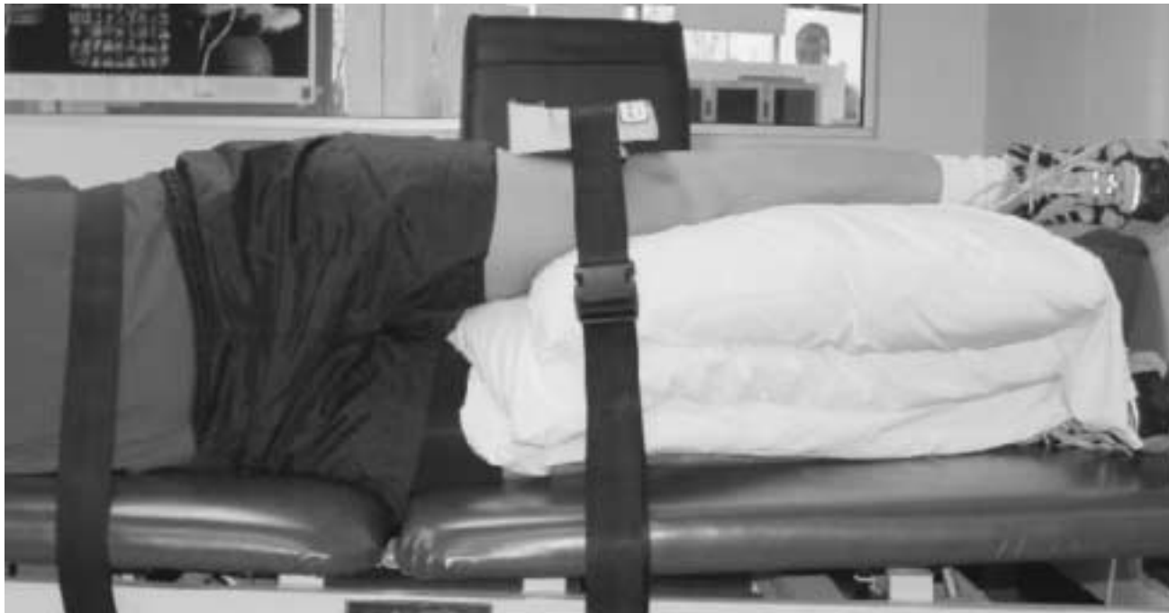
FIGURE 1. Isometric strength testing of hip abduction using straps and hand-held dynamometer.

We used a clinically significant strength difference of 15% between groups and estimates of sample variability from previous literature 3,5 to perform an a priori power analysis. This analysis suggested that 25 to 30 subjects would provide adequate protection from type I and II errors using \alpha = .05 and \beta = .20 . However, during data collection, it became evident that the true difference between groups was significantly larger than the difference used in the power analysis. Therefore, data analysis was performed after 15 subjects had been tested per group. Independent t tests were used to compare hip abduction and exter-